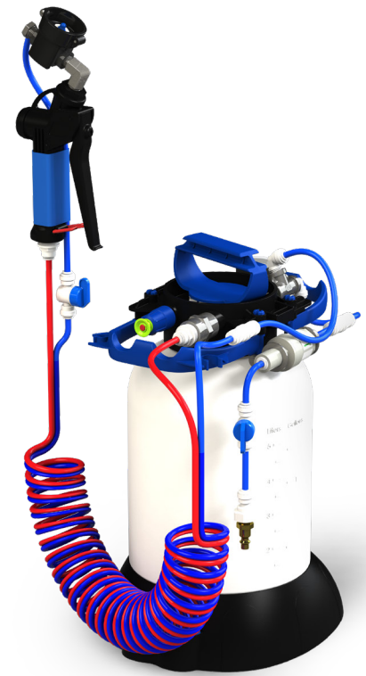
MU50-PSGN130 – 1.3 gallon (5 liter) unit

Handheld misting wand allows for controlled, manual application to critical surfaces